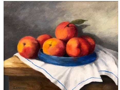
3 rd Place Peaches by Judy Sanders