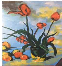
“Tulips in Vase”