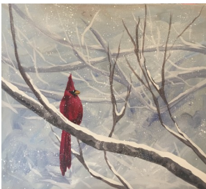
“Cardinal in Winter”